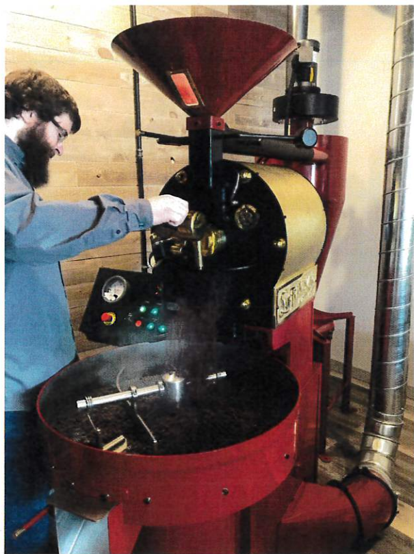
Pictured is our SF10 production roaster

Village Roasters is an independent coffee roastery located in Green Bay WI. We are excited to partner with Pioneer Elementary to raise funds selling specialty coffee! All coffee purchased through fundraising is small batch roasted in-house to order. You will receive your coffee at peak freshness!